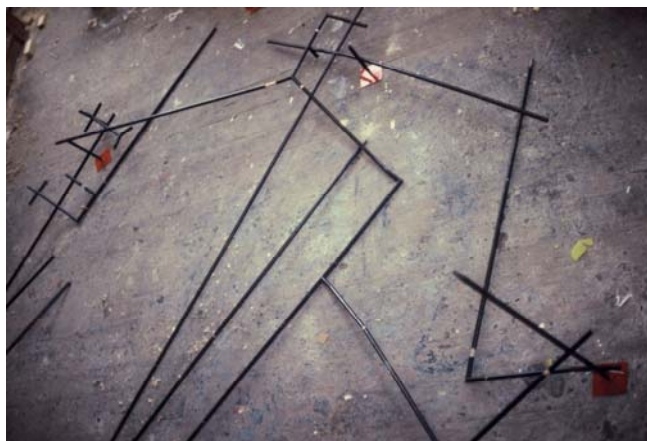
Fig 7: Brower Hatcher, installation of sculpture for Event One , 1969 photo © the artist

Films either made by computer or dealing with the subject were screened in the lecture theatre in daily sessions. These included Anthony Pritchett's The Flexipede (1967), the first fully surviving work of computer animation created in Britain. Unfortunately a complete list of films screened does not survive, but interestingly these were among the most controversial of exhibits eliciting either praise or derision in fairly equal measures from visitors (according to CAS questionnaires completed by visitors). Also on display were graphics by Bob Parslow from the computing department of Brunel University, who had, with Prof. Michael Pitteway, devised an early method of drawing on an Elliott 803, c.1966. Several American graphics were due to be exhibited but were held up in Customs, who seemed to believe that art made by machine was dutiable. This included Ken Knowlton and Leon Harmon's Studies in Perception (1966), a large plotter print of a nude constructed from the alphanumeric characters of an ASCII printer produced at Bell Telephone Laboratories (reported on the front page of the Evening News 29/03/69, 'Customs Seize Computer's Nude').