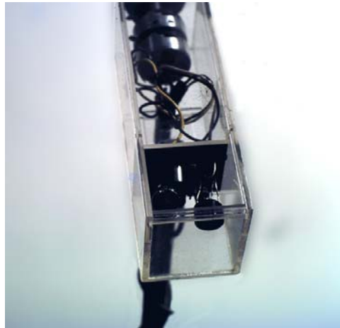
Fig 5: John Bucklow, The Folder (photo resistors coupled to flip-flop circuit with a square wave output), 1968 © The artist

Nutbeam, published in Studio International , illustrated how this work was programmed. Benthall reported that ‘The audio effect is of a low continuous sound punctuated by higher-pitched sounds [...] vibrating through one’s whole nervous system and accompanied by the pulsing lights of variable brightness.’ [18]